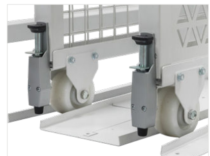
BUILT-IN FOOT BRAKE